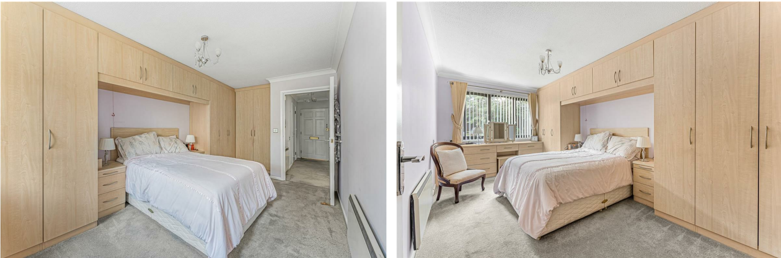
Approximate Gross Internal Area 547 sq ft - 51 sq m